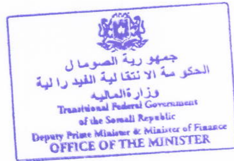
Sharif Hassan Sheikh Aden Deputy Prime Minister/Minister of Finance

Although we know that there is still much more work to be done and that even greater efforts will be required, the demand by the international community in respect of the financial operations implemented so far is enough to motivate us to continue to report quarterly or annually.