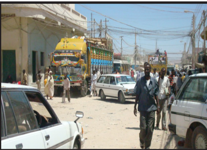
Xarunta Ganacsiga Puntland ee Bosaso

Isku shaandhaynta iyo Isbedelka Madaxweyne Faroole uu Toddobaadkan ku sameeyay Xukuumadiisa ayaad moodaa in si isu dhow amaba isku mid ah looga arkay dhinacyo badan oo awal hore shaki ka qabay in isbedel Noocan oo kale ah uu imaan karo.